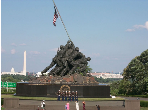
God Bless the United States Marine Corps and all our Armed Forces