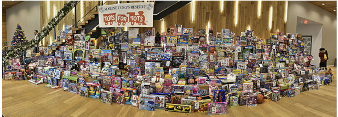
A Great Day for Slattery Detachment and T4T.

As per usual the Bayer Corporation and its employees held a Toys for Tots toy distribution gathering that was second to none. Five members of the detachment met in the Bayer National Headquarters in Whippany on December 14th.