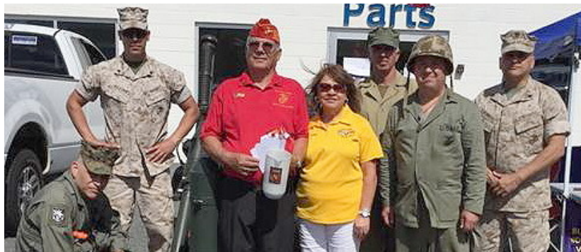
9/11- 2016 The 8TH Annual Corvette & open car show held at Schumacher Chevrolet Clifton NJ. Proceeds to Benefit Slattery Detachments Marines Care Foundation.

All proceeds go to support our Combat Wounded Military and their families! www.injuredmarinesfund.org