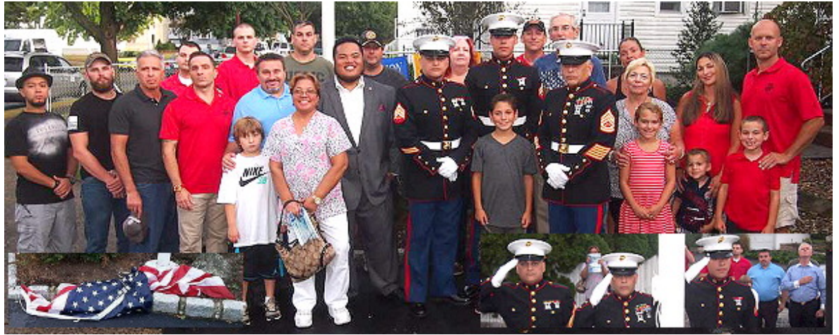
Neighbors who came out in support. (Left Insert= original flag cut down). (Right Insert= New flag raised).