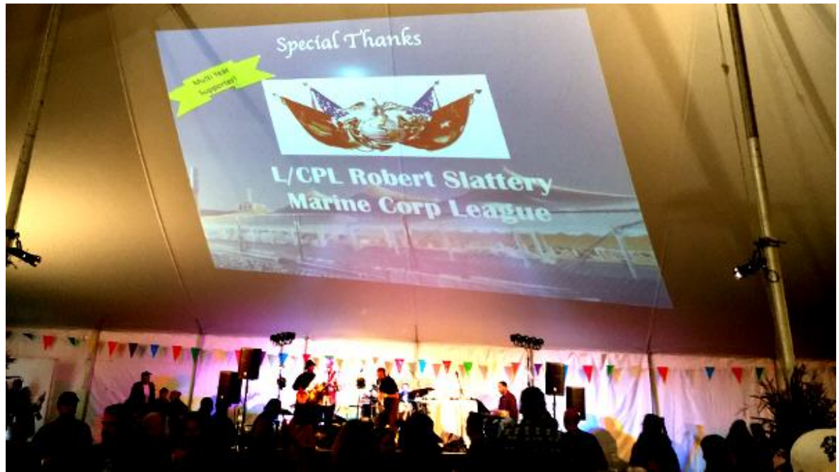
Entertainment under the Big Top. Annual Oktoberfest at our Lady of the Lake Church, Verona. The large crowd enjoys the food, music, refreshments and friends for a very enjoyable evening.